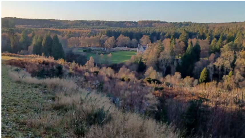
Above: Image looking across Narrow wooded valley from Ferness, Airdrie block, towards Coulmony House

Open Rolling Upland Landscape Character Type (LCT291) forms a relatively narrow band of broad rounded hills, interspersed with shallow valleys and low-lying moss. Key characteristics relevant to Furness are: