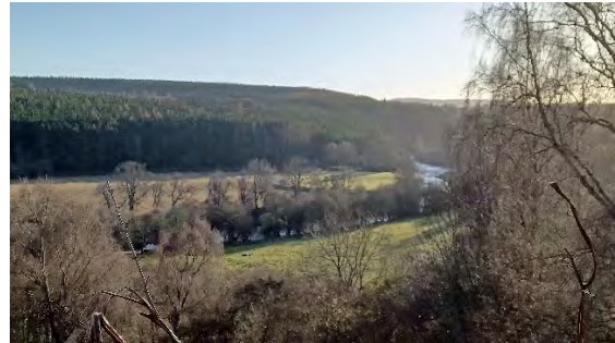
Above: Images of Findhorn river in the heart of the Narrow Wooded Valley LCT with Ferness woodland in background