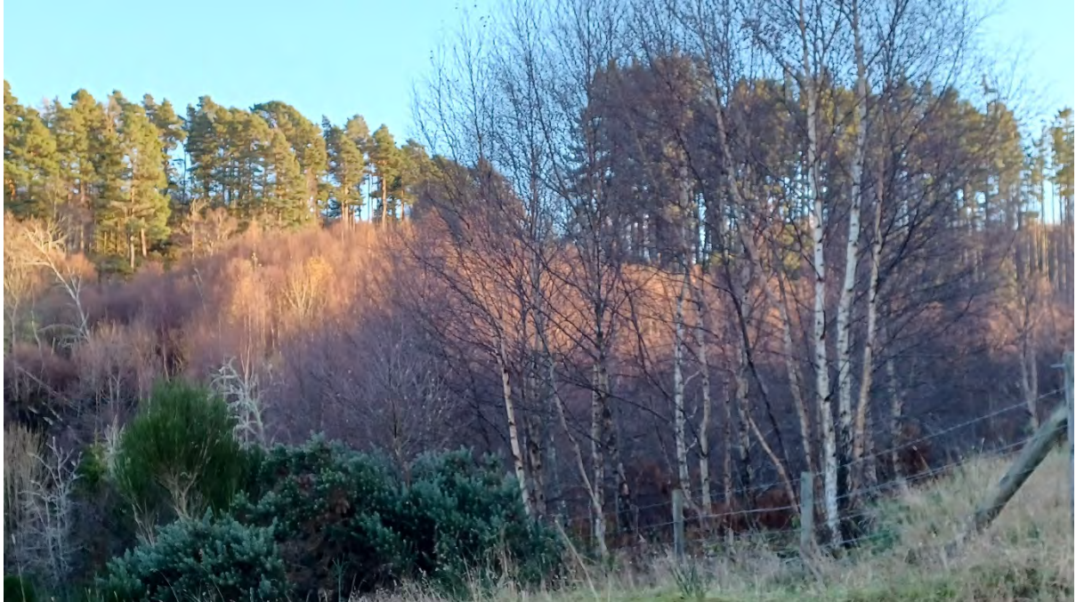
Below: Internal view of Ferness Forest