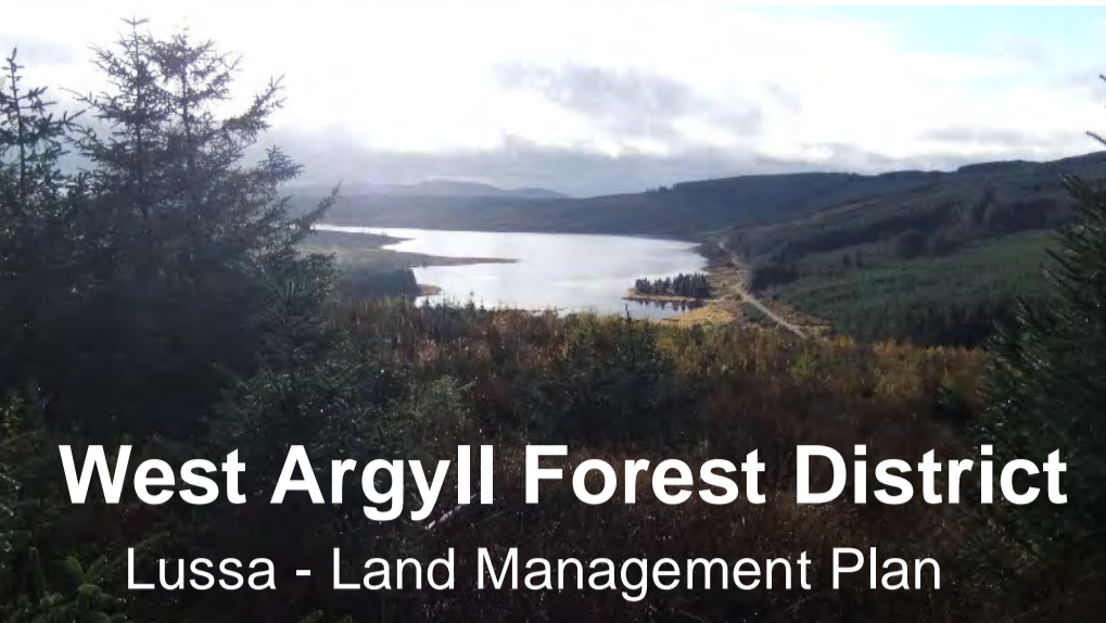
West Argyll Forest District Lussa - Land Management Plan