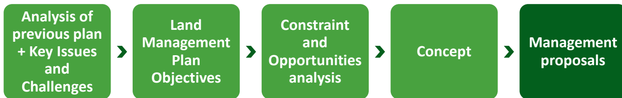
Figure 2 – This shows the process of developing LMP objectives and management proposals.

This section describes how the LMP objectives detailed in section 1.2 have been developed and how these inform the current management proposals.