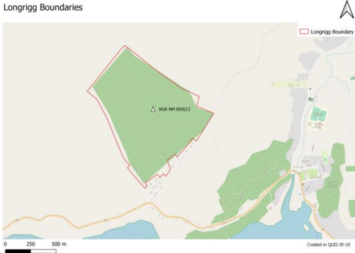
Map 1 – Longrigg Woodland Boundaries.

The area of woodland known as Longrigg, currently under ownership of Forestry and Land Scotland, is situated to the north of the A861 at Ardnastang, Sunart. Its total area is 87 hectares with a perimeter of approximately 3,890 meters. Map 1 below shows the boundaries of the woodland.