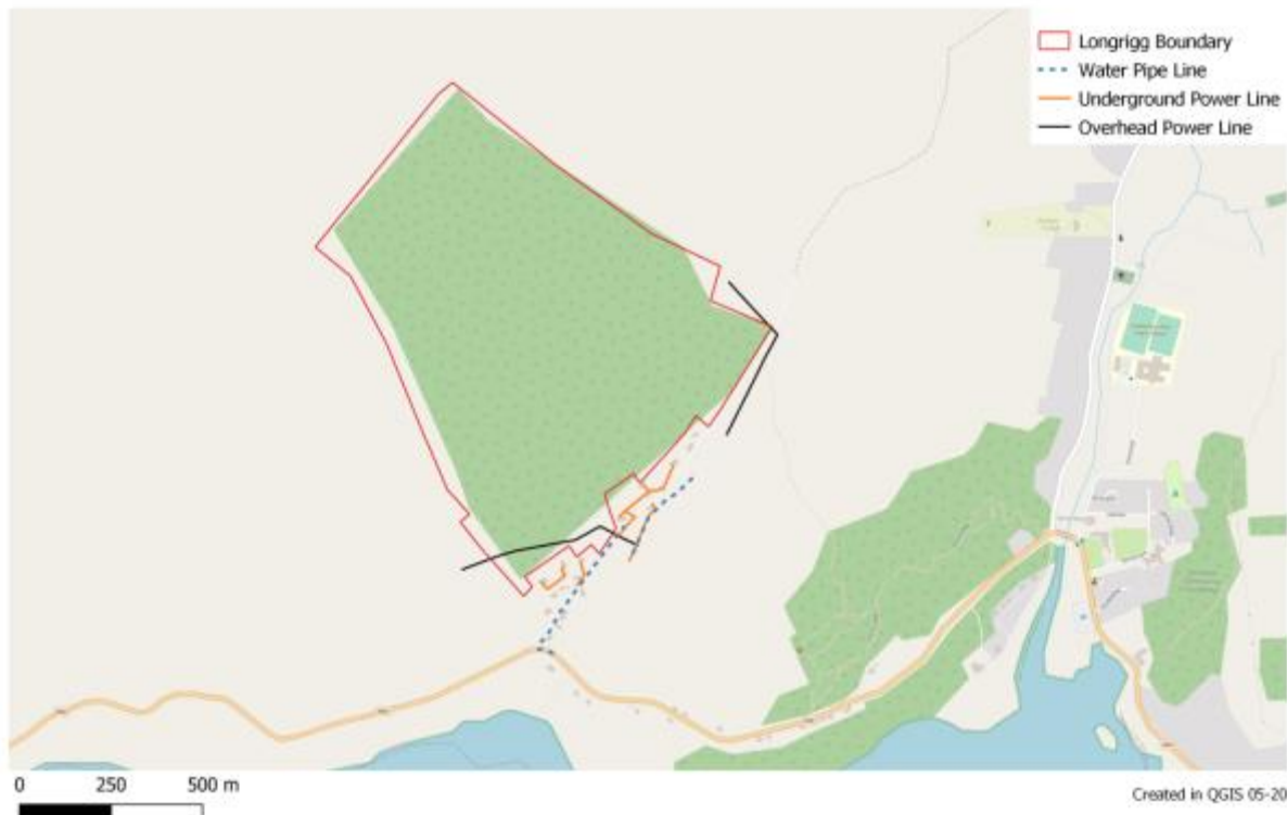
Map 2 – Constraints and Services.

Not to scale. For scale version see appendix 5.